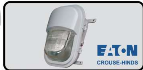
LUMINAIRE FOR INTERIOR OR EXTERIOR MOUNTING CHAMP-PAK CPMV CLASS 1 DIVISION 2