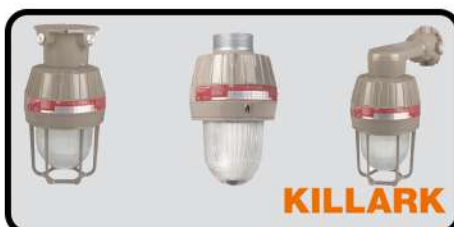
EML LED LUMINAIRE CLASSIFIED AREAS CLASS 1 DIVISION 1