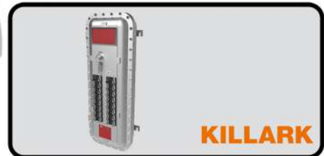
CLASS 1 LIGHTING DISTRIBUTION BOARD, DIVISION 1 & 2