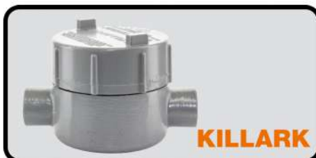
ROUND CONDULET BOX GEB TYPE C FROM 1/2 TO 2" CLA 1, DIV 1 & 2