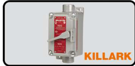
20A ON-OFF ROTARY SWITCH, FOR AREAS CLASSIFIED CLASS 1, DIVISION 1 & 2, NEMA 7