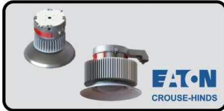
LED INDUSTRIAL LIGHT, FOR WET PLACES