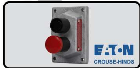
DSD970 CONTROL STATION WITH PUSH BUTTON