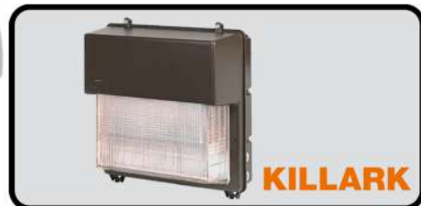
KWPL LED WALL MOUNT LUMINAIRE 120-277V CLA 1, DIV 1 & 2