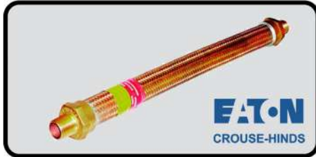
COUPLING WITH BRONZE MESH 1 X 15 CL 1 -DIV 1 & 2