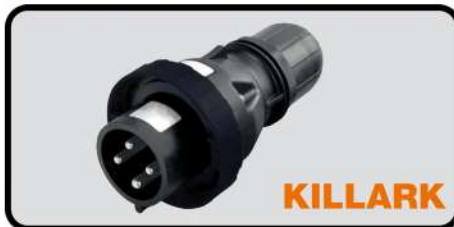
63A VSIH INDUSTRIAL PLUG, 3P+T