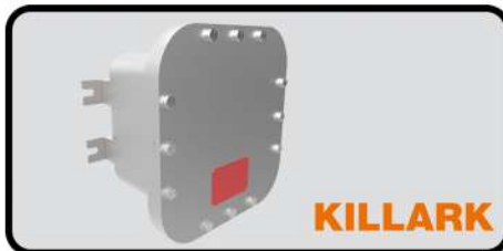
EXBLT CONNECTION BOX WITH BOLT-ON COVER CLA 1, DIV 1 & 2