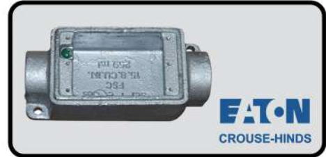
FSC EXPLOSION PROOF RECTANGULAR BOX