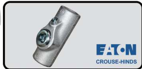
HV FIRE SEAL FOR CLASSIFIED AREAS