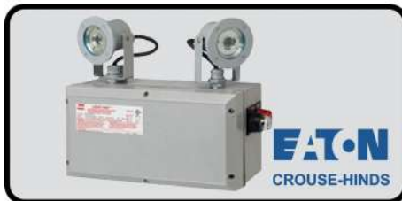
N2LPS 2 X 3W LED EMERGENCY LIGHT, FOR CLASSIFIED AREAS