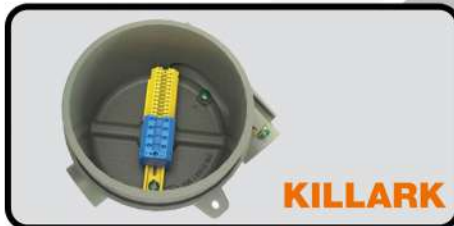
HKBX TB TYPE BOX, FOR AREAS CLASSIFIED 630VAC-60A. MAX