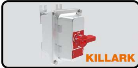
30A DISCONNECT SWITCH, FOR CLASSIFIED AREAS, CLASS 1 DIVISION 1 & 2