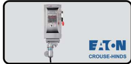
ARKTITE WSR/WSRD CLOSED DISCONNECT SWITCH WITH SHEET STEEL