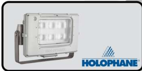
LED PROJECTOR FOR CLASSIFIED AREAS