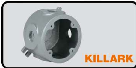
NEMA 4 ALUMINUM CIRCULAR VJ OUTLET BOX WITH 1/2" TO 1" INLET