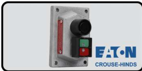
DSD962 START-STOP CONTROL STATION, CLASS 1 DIVISION 1 & 2