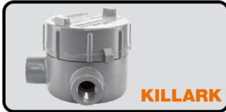
GEB ROUND CONDULET BOX TYPE L FROM 1/2 TO 2" CLA 1, DIV 1& 2