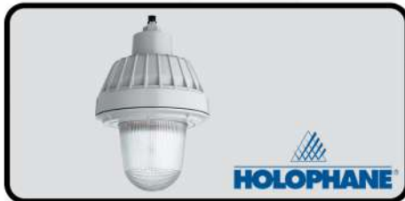
EXPLOSION PROOF CLASS I LED LUMINAIRE, DIVISION 1