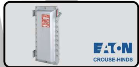
EBMB CONTROL CABINET CLASS 1 DIVISION 1 & 2