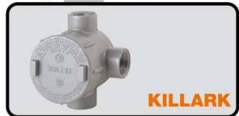
GEB ROUND CONDULET BOX TYPE T FROM 1/2" TO 2" CLA 1, DIV 1& 2