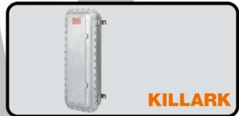
B7E CONNECTION BOX WITH BOLT-ON COVER CLA 1, DIV 1 & 2