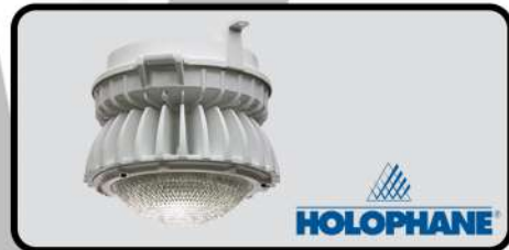
INDUSTRIAL LED LUMINAIRE, CLA.1, DIV 2, IP66