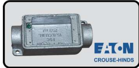
FSC TYPE EXPLOSION PROOF RECTANGULAR BOX