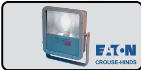
FMV REFLECTOR FOR CLASSIFIED AREAS CLASS 1, DIVISION 1 & 2. IP66