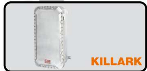
EXB CONNECTION BOX WITH BOLT-ON COVER CLA 1, DIV 1 & 2