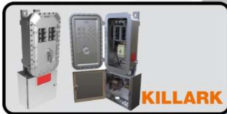
D2LC AUTOMATIC LIGHTING SWITCH CLASS 1, DIV 1 & 2