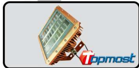
LED REFLECTOR LUMINAIRE FOR CLASSIFIED AREAS