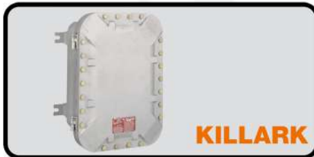
EXB LITE NEMA 4X CLA 1, DIV 1 JUNCTION BOX