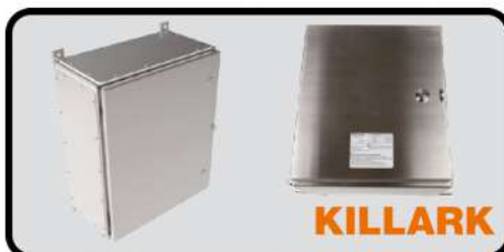
USF TYPE 316 STAINLESS STEEL CONNECTION BOX