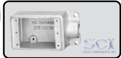
IRON FS DEVICE BOX FOR DEVICE WITH 3/4" AND 1" INLET