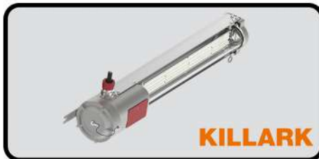
L1L LED LINEAR LUMINAIRE FOR HAZARDOUS AREAS CLASS 1, DIV 1 & 2, IP66