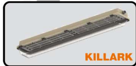
LZ2SL LED LINEAR LUMINAIRE FOR CLASSIFIED AREAS CLA1 DIV 1 & 2, IP66