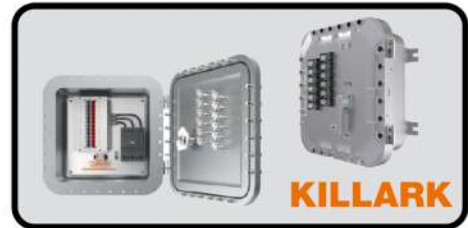
EXBSP1 DISTRIBUTION BOARD FOR CLASSIFIED AREAS CLASS 1, DIVISION 1 & 2