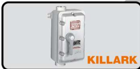
40A ON OFF SWITCH FOR CLASSIFIED AREAS CLASS 1, DIVISION 1 & 2 NEMA 4X