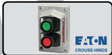
DSD922 START-STOP CONTROL STATION, CLASS 1 DIVISION 1 & 2