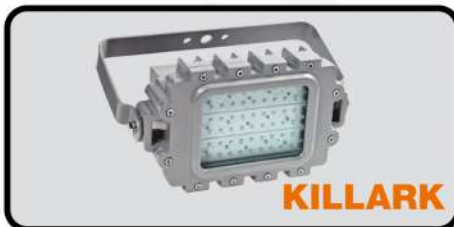
KF1L LED REFLECTOR FOR CLASSIFIED AREAS CLASS 1 DIVISION 1 & 2 IP66