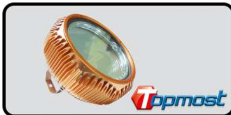
LEOPARD LED LUMINAIRE FOR CLASSIFIED AREAS, IP66, ZONE 1 & 2