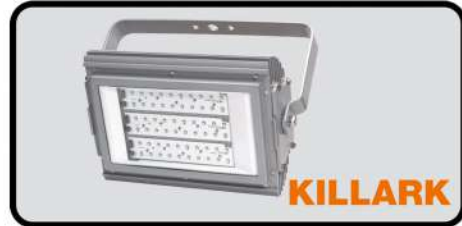
KFL LED PROJECTOR FOR CLASSIFIED AREAS 1. DIV2