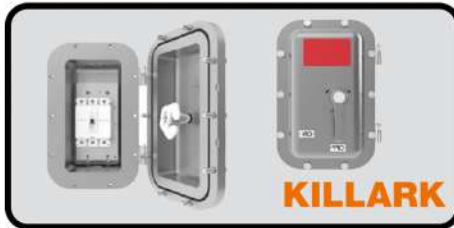
ON-OFF SWITCH, 100 A MAX CLASS 1, DIV 1 & 2 NEMA 4X