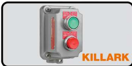
FXCS CONTROL STATION WITH START STOP PUSH BUTTON, CLASS 1, DIV 1 & 2,