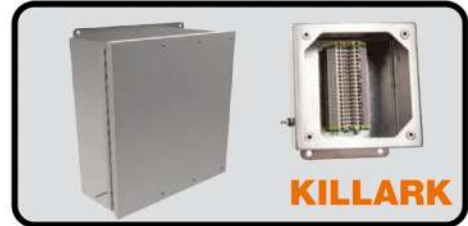
HINGED TERMINAL BOX FOR HAZARDOUS AREAS