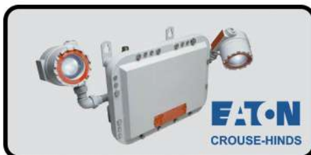
EML LED LUMINAIRE CLASSIFIED AREAS CLASS 1 DIVISION 1