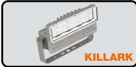
STANDARD MOUNT LED REFLECTOR, CLASS 1, DIV 1 & 2, IP66