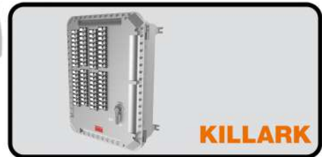
AUTOMATIC CIRCUIT BREAKER CLA 1, DIV 1 & 2