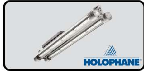
EXPLOSION PROOF LED LINEAR LIGHT, CLA 1, DIV.1