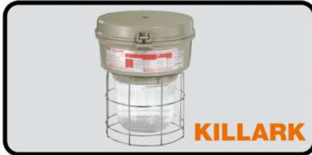
EEML LED LUMINAIRE FOR CLASSIFIED AREAS, CLASS 1, DIVISION 2, IP66,