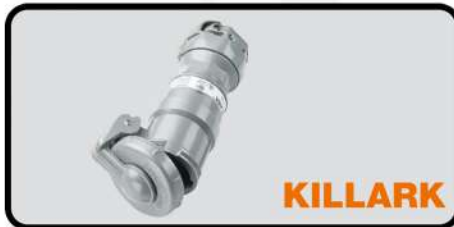
TAKE FOR AREAS CLASSIFIED CLASS 1 DIVISION 2