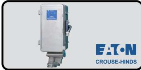
ALUMINUM SWITCH FROM 30A TO 100A, NEMA 3R