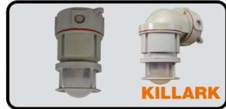
VM4L LED LUMINAIRE FOR CLASSIFIED HAZARDOUS AREAS CLASS 1 DIVISION 1 & 2, IP66