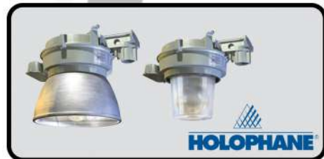
LOW BAY LUMINAIRE FOR CLASSIFIED AREAS