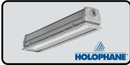
LINEAR LED LIGHT FOR CLASSIFIED AREAS