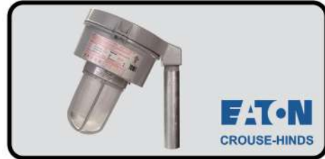
HID CHAMP VMV LUMINAIRE FOR AREAS CLASSIFIED IP66, NEMA4X