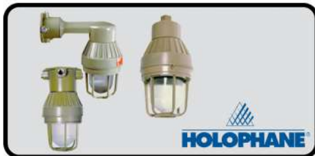
LIGHT HEAD LUMINAIRE FOR CLASSIFIED AREAS