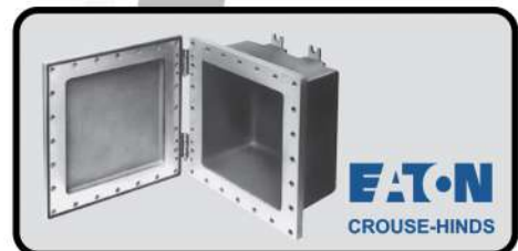
EJB CABINET CLASSIFIED AREAS CLASS 1 DIVISION 1 & 2