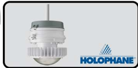
CLA 1 DIV 1 & 2 LED PENDANT LIGHT, NEMA4X