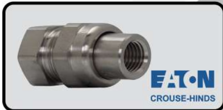
DOUBLE HH STEEL UNION FOR CLASSIFIED AREAS