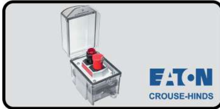
PROTECTIVE BOX FOR EDS(C) AND EFD(C) BOXES