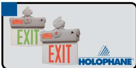
EMERGENCY EXIT SIGN FOR CLASSIFIED AREAS