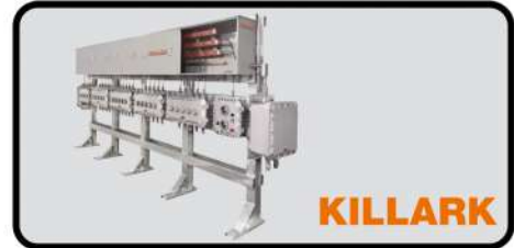
CUSTOM DISTRIBUTION BOX CLASS 1 - DIVISION 1 & 2