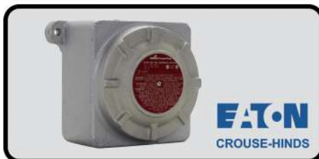
GUB JUNCTION BOX FOR CLASSIFIED AREAS