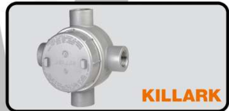
ROUND CONDULET BOX GEB TYPE X FROM 1/2 TO 2" CLA 1, DIV 1& 2