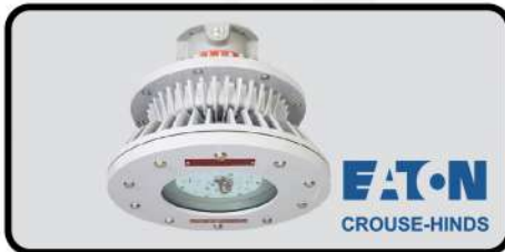
EXPLOSION-PROOF LED LUMINAIRE FOR CLASSIFIED AREAS CLA 1 DIV 1