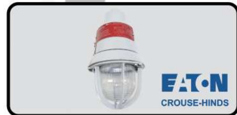
EVLED LED LUMINAIRES, FOR CLASSIFIED AREAS