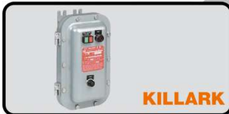
CLASS 1 LINE STARTER - DIVISION 1 & 2 NEMA 4X