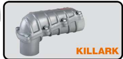
ELBOW WITH CAP XALB EXPLOSION PROOF CLASS 1 DIVISION 1 & 2