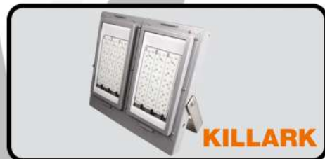
KFLH LED REFLECTOR FOR CLASSIFIED AREAS CLA 1 DIV 1 & 2, IP66