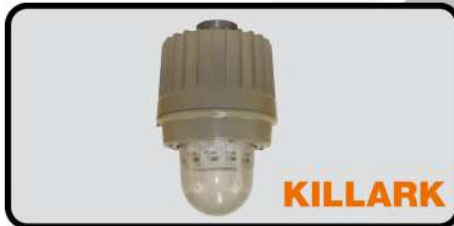
HIGH BAY INDUSTRIAL LED LUMINAIRE CLASS 1 DIVISION 1 & 2