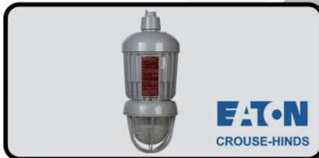
HAZARD-GARD EVM HID LUMINAIRES FOR CLASSIFIED AREAS CLA 1 DIV 2