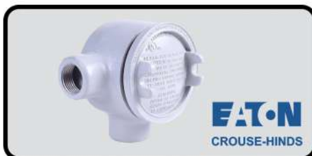
GUAL JUNCTION BOX WITH THREAD COVER CLASS 1 DIV 1 & 2