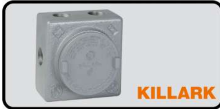
GRSS JUNCTION BOX FOR CLASS 1, DIVISION 1 & 2 HAZARDOUS AREAS