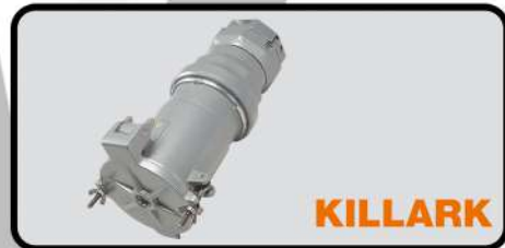
VERSAMATE INDUSTRIAL SPRING OUTLET WITH COVER