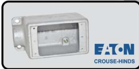
RECTANGULAR CONDULET BOX FS WITHOUT LID CLASS 1 DIVISION 1 & 2