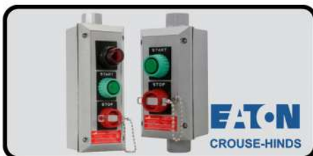
N2S and N2SC CONTROL STATIONS