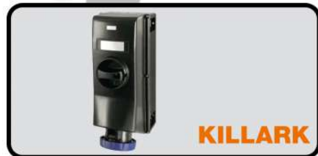
63A VSIH INDUSTRIAL RECEPTACLE, 3P+N+T