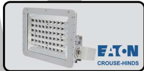
CHAMP FMV LED REFLECTOR FOR CLASSIFIED AREAS FROM 70W UP TO 450W