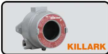
CIRCULAR BOX WITH HK VIEWER FOR CLASSIFIED AREAS CLA 1 DIV 1& 2