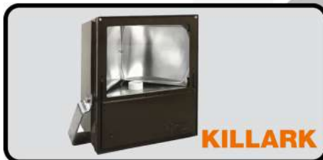
CLASS 1 DIVISION METAL HALIDE REFLECTOR. 1 & 2 NEMA4X, IP66