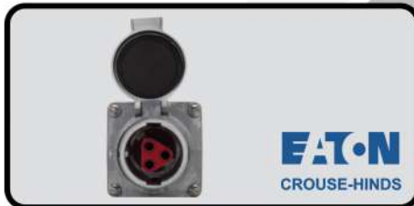
INDUSTRIAL POWER SOCKET ARKTITE AR 30A 3P-3W 600V NEMA 4 UL