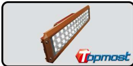
LED OUTDOOR REFLECTOR, FOR CLASSIFIED AREAS, IP66