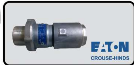
INDUSTRIAL PLUG APJ 30A 3P-3W 600V NEMA 4 UL