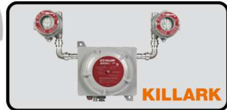
EBS EMERGENCY LIGHT FOR CLASSIFIED AREAS CLASS 1, DIVISION 1 & 2