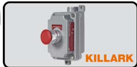
FXCS CONTROL STATIONS WITH MUSHROOM HEAD PUSHBUTTON CLASS 1, DIV 1 & 2, NEMA7