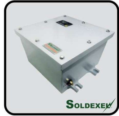
Passage or Distribution Boxes Nema 4x, IP66