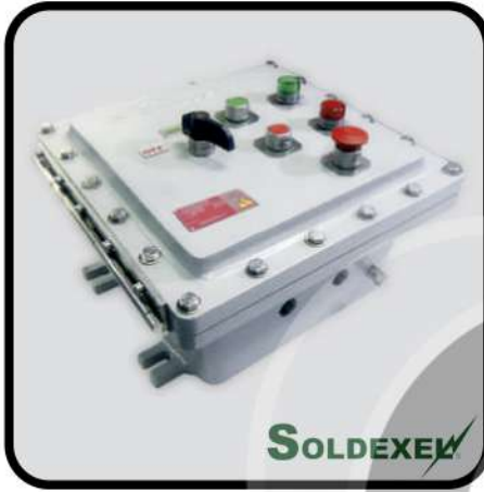
Explosion Proof Nema 7 Junction Box