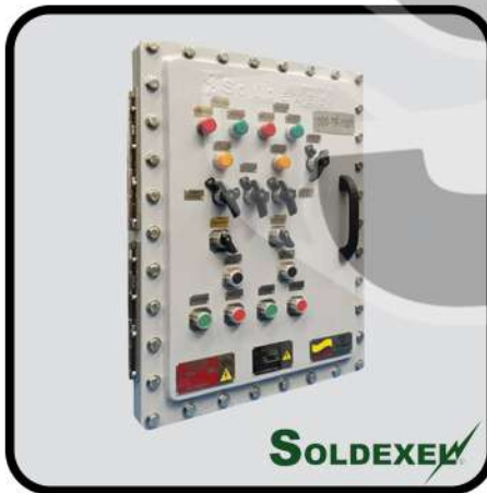
Electrical Board For Classified Areas