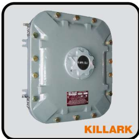
EXB-NFD, EXB-FDS Series